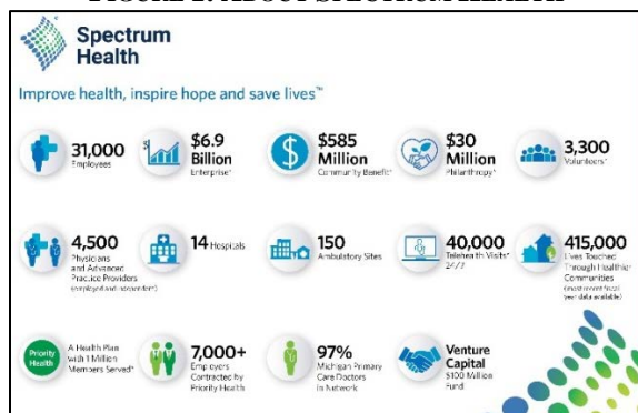
FIGURE 1: ABOUT SPECTRUM HEALTH

Spectrum Health is well recognized as one of the nation's top health systems by Truven Health Analytics and IBM Watson Health. From a financial perspective, Spectrum Health is a $7 billion organization. It is highly rated by both Moody's Investors Service and Standard and Poor's since 1998. The stable ratings vindicate the value and commitment