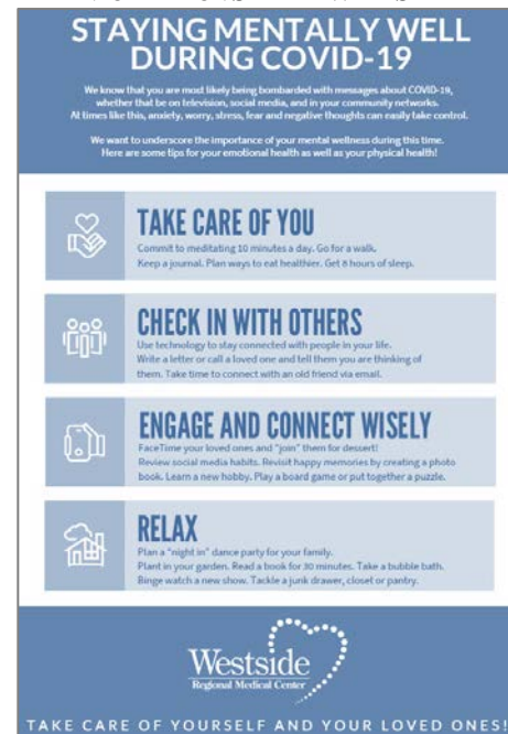
FIGURE 3: HCA WESTSIDE STRESS RELIEVING TACTICS INFORMATION SHARED WITH STAFF

well as minimizing the infection spread, optimizing the use and burn rate of critical items such as PPEs, and ensuring that the best of service is provided to the best of extend during this pandemic had been the constant endeavor of the organization.